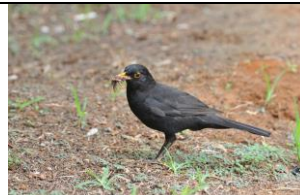
Blackbird שחרור