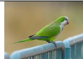
Monk Parakeet תוכי מירי