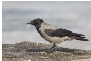
Hooded Crow עורב אפור