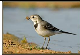
pie Wagtail נחליאלי לבן