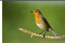
Robin אדום החזה