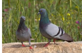
Feral Pigeon יונה حمام טוראני