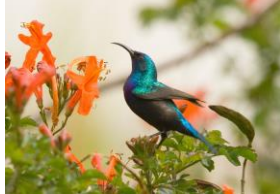
צופית בוהקת ابو الزهر Palestine Sunbird