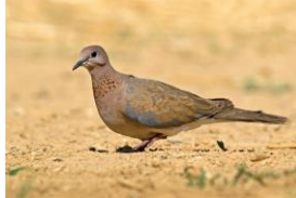
Laughing Dove צוצלת נביסה