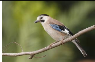
Jay עורבני שחור כיפה