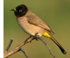
Bulbul בולבול בליב