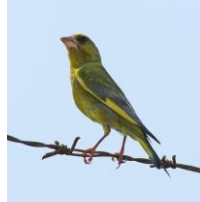
Greenfinch ירקון חסון