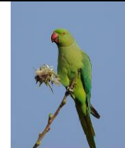
Rose-ringed Parakeet דררה