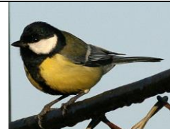
Great Tit ירגזי מצוי