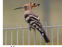
Hoopoe דוכיפת