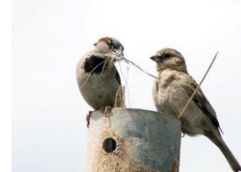
House Sparrow דרור הבית