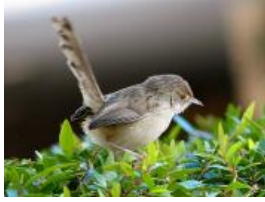
Graceful Prinia פשוש פסיסי