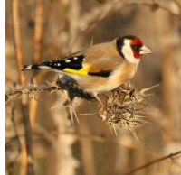
Goldfinch נוחית חסון