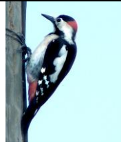
Syrian Woodpecker נקר סורי